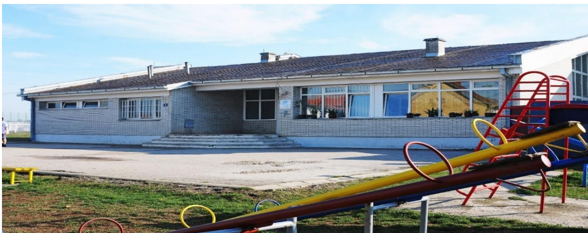
Figure 3 The primary school in Crne Medje