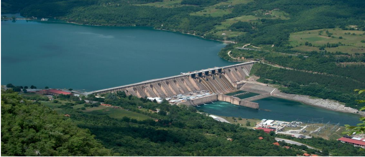
Figure 6 HPP Bajina Bašta