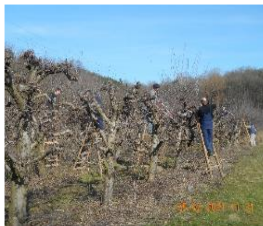
Figure 4 The initiation of wheat flowering and trimming fruits

Branch MB Kolubara executed works on clearing cut in some areas of the local community Zeoke around crofts, the local community Junkovac next to the road, clearing firefighting road in the local community Vreoci, for routing forest and firefighting roads in the local community Mirosaljci, clearing the dam on Paljuvi Lake.