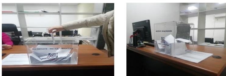
Figure 2 The box for the receiving submissions located at the PE EPS record office