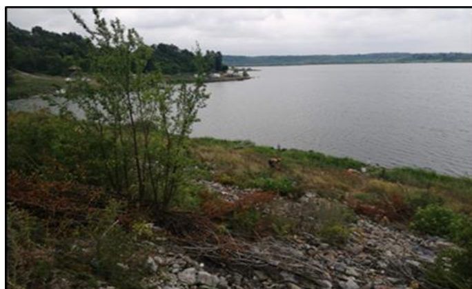
Figure 5 Paljuvi Lake

Branch MB Kolubara executed works on clearing cut in some areas of the local community Zeoke around crofts, the local community Junkovac next to the road, clearing firefighting road in the local community Vreoci, for routing forest and firefighting roads in the local community Mirosaljci, clearing the dam on Paljuvi Lake.