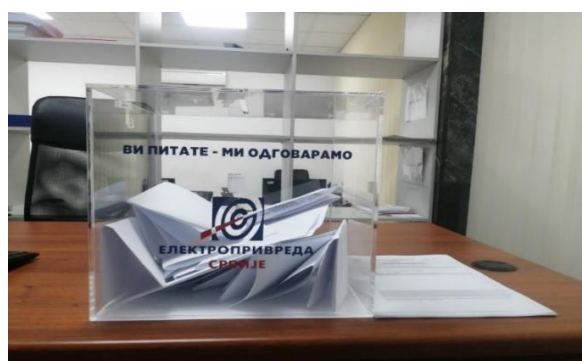
Figure 1 The box for the submissions

A submission may be given in a free form or on the form for submissions, which is available for download on the website as well as in the records office of PE EPS. Also, appreciating the needs of the stakeholders, PE EPS additionally introduced and installed boxes for receiving submissions at several locations, (Figures 1 and 2).